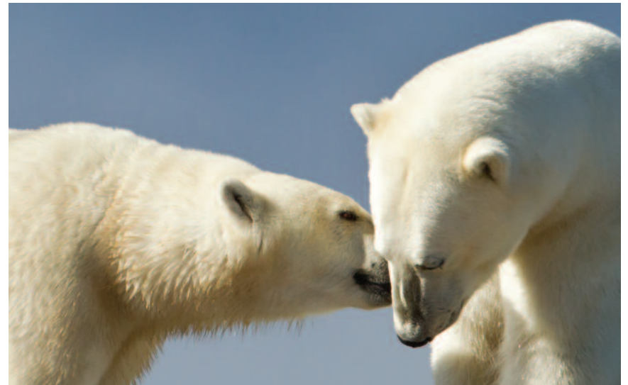
Cub and Sow, affection, Arvia'juaq-0292

When travelling on the land, make sure to listen to your guide and stay nearby.