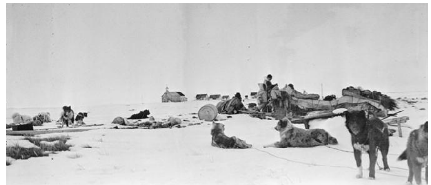
Eskimo Point circa 1930

Arviat's name was derived from the Inuktitut word arviq because the nearby coastal landscape resembles the shape of a bowhead whale. Traditionally, this location was known as Tikirajualaaq, meaning a little long point. Thule culture sites here date back to AD 1100 – the Thule are the direct ancestors of today's Inuit. Many ancient qajaq stands and tent rings found at traditional summer campsites are evidence that hundreds of Inuit gathered